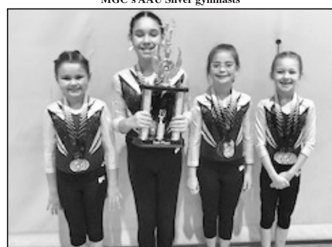
MGC's AAU Level 1 gymnasts